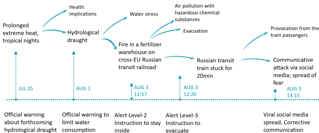
Figure 2. Structure of Cascading Crisis Scenario in Kybartai

Preparedness within this riskscape is characterized by low and largely unplanned engagement. Most households lack basic reserves of food, water, or survival supplies, and knowledge of civil protection measures is limited. Risk perception and preparedness are strongly anchored in historical experience rather than current risk signals. A notable gap exists between formal municipal crisis management arrangements and public awareness of available support, reinforcing an institutional-public disconnect. Against this background, a hypothetical cascading crisis scenario was developed for Kybartai, set in August 2026 (see Figure 2).